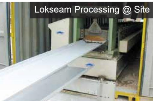
Lokseam Processing @ Site